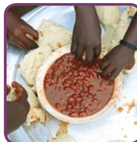
Children dip a traditional bread into beans.